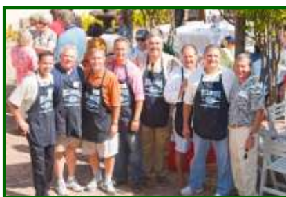
Bellarmine Alumni Group Great Volunteers!

It's still hard to imagine how this disparity can continue to exist in such a wealthy place like Silicon Valley, but it is true. Never before has the need to feed so many been so great.