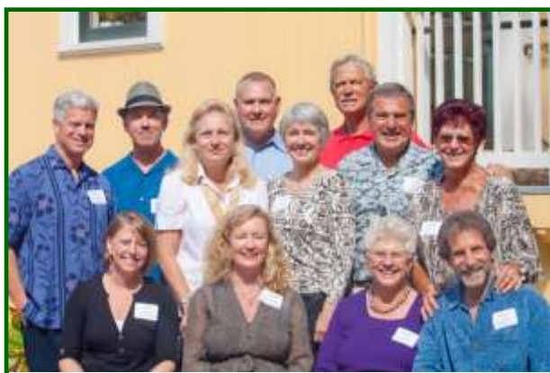
Loaves & Fishes Board & Advisory Board Members