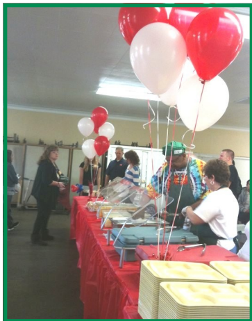
Special Feast for Feb 14th!

Volunteers are the heart and soul of Loaves and Fishes Family Kitchen. I often tell people that the best part of my job is spending my days with people who want to do nothing more than to give back.